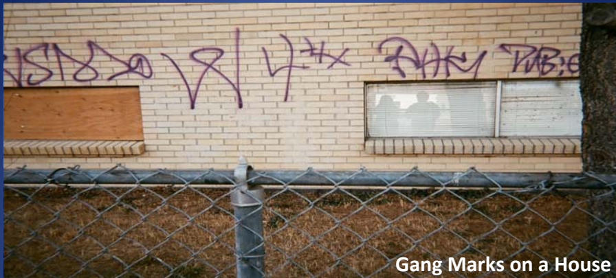
Gang Marks on a House